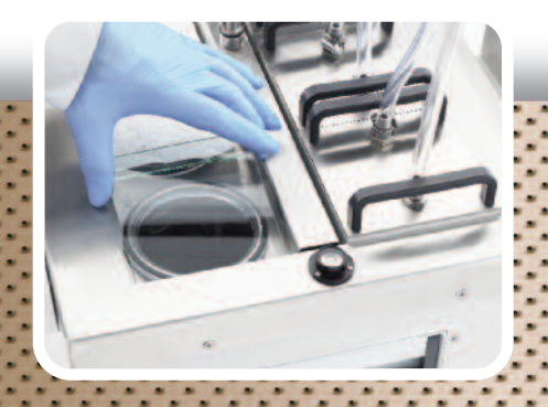
Sealed bath surface prevents the bath fluid from condensing on the glass plate