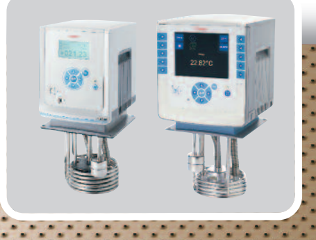
Robust pump design for uniform sample temperatures