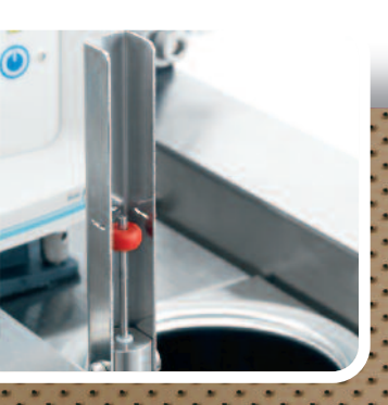
view liquid level to ensure proper fluid levels are ed

Notes: Refer to the ordering information for the part #. Heat transfer fluid oil and DIDP is sold separately. All accessories can be purchased separately.